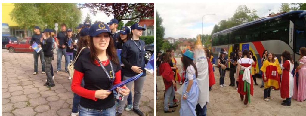
Students distributing EU promotional material EU bus and students ready for EU mask ball

The following activities took place in Doboj area: