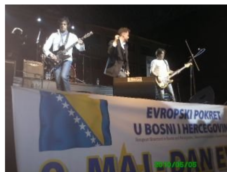
Concert by REGINA