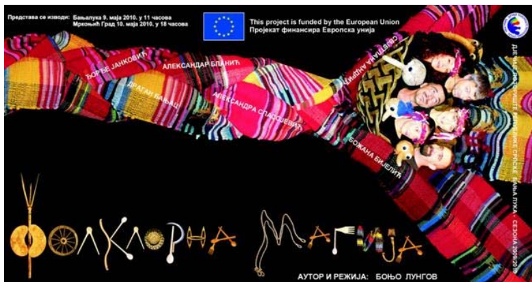
Folklore Magic poster

In order to teach children tolerance, respect of differences and informing them about the EU, the Kid's Theatre of Republika Srpska organised and performed a theatre play " Folkorna magija " on 9 May in Banja Luka and on 10 May in Mrkonjic Grad. Close to 8000 children had an opportunity to enjoy in the performance given by the renowned Kid's theatre and especially in Mrkonjic Gard where there are hardly any plays performed in the recent history.