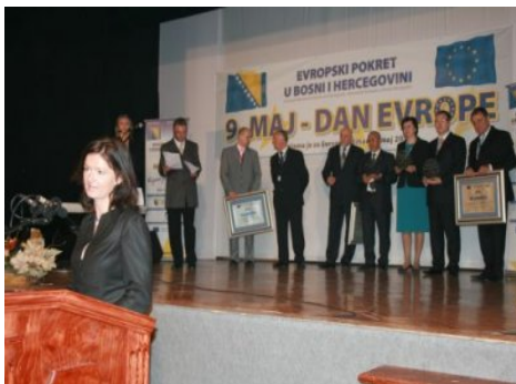
MEP Tanja Fajon addressing the audience

Marking of the Europe Day in BiH started in Bihac on Wednesday, 5 May 2010 with the event organised by the NGO 'European Movement'. High Representative and EU Special Representative in BiH Valentin Inzko , Chairman of the BiH Council of Ministers Nikola Spiric and Member of the European Parliament Tanja Fajon also took part in this event using the opportunity to stress again the importance and necessity of European integration for BiH. Awards were presented to individuals, organisations, TV shows and others who contributed to the European integration process of BiH. In the evening hours, the popular rock band "Regina" which represented BiH on the Eurovision Song Contest last year, gave a concert in the centre of the town.