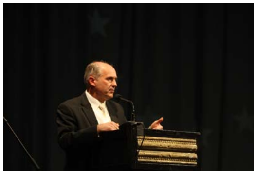
Address by EUSR Inzko

Prepared by Press and Information Section