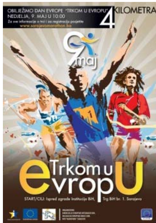
"Run to Europe poster"