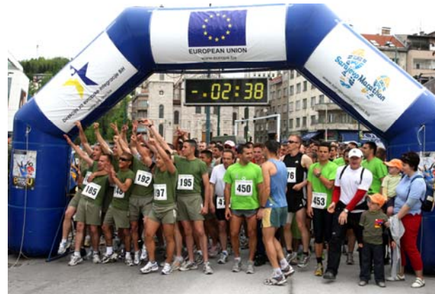
Start of the race

The race was a great success with total of 524 participants, which is more than in previous year being an absolute record of any single short distance race in BiH. The competitors included university and high-school students, primary-school pupils, representatives of athletic clubs from BiH and region and ordinary citizens. If googled, the race "Run to Europe" can be found on more than 100 web sites, both in local and in English language. The top three finishers in the men's and women's categories were awarded with the Run to Europe medals. On this occasion billboards and posters were placed in the town to attract more participants while specially designed T-Shirts were distributed to all those who finished the race. The interest of citizens was large and it was excellent opportunity to distribute the EU promotional material to citizens.