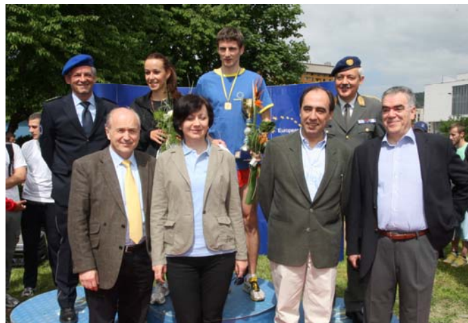
Heads of EU Missions in BiH and DEI Director with the winners of the race

The race was a great success with total of 524 participants, which is more than in previous year being an absolute record of any single short distance race in BiH. The competitors included university and high-school students, primary-school pupils, representatives of athletic clubs from BiH and region and ordinary citizens. If googled, the race "Run to Europe" can be found on more than 100 web sites, both in local and in English language. The top three finishers in the men's and women's categories were awarded with the Run to Europe medals. On this occasion billboards and posters were placed in the town to attract more participants while specially designed T-Shirts were distributed to all those who finished the race. The interest of citizens was large and it was excellent opportunity to distribute the EU promotional material to citizens.